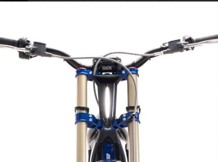
EM HANDLEBAR BY NEKEN*