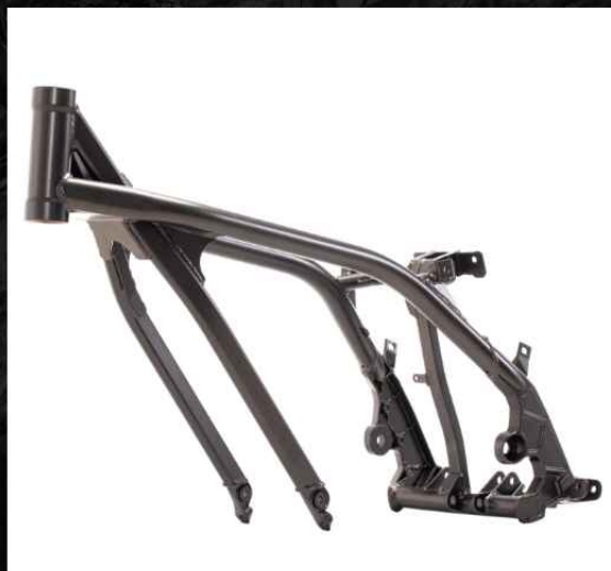
NEW FRAME COLOR