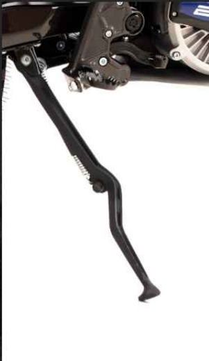
EM 2023 STAND