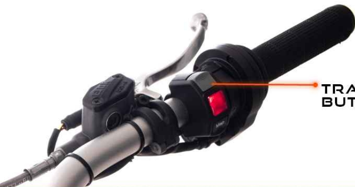
TRACTION CONTROL BUTTON

Fortunately, Traction Control offers you the best possible traction to keep control in all circumstances.